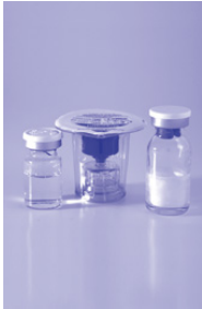
Table 1 COAGADEX Reconstitution Instructions